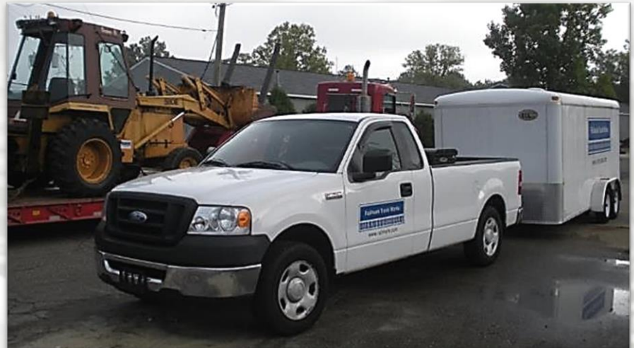
Railmark personnel preparing for maintenance work.