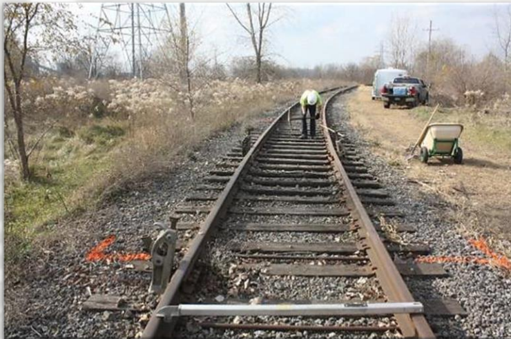
Railmark personnel conducting track inspection and repair on an industrial track in Indiana.

Railmark performs track construction & maintenance in multiple US markets where the company either has an operating railroad or one of its Railmark Rail Service Centers. Railmark's Rail Service Centers are designed to perform track work, railcar repair, and rail logistics from the same facility using the same local teams. Railmark offers its ECOrail® line of biobased, biodegradable rail lubricants made from USA-grown crop oils and have both EPA and USDA designations.