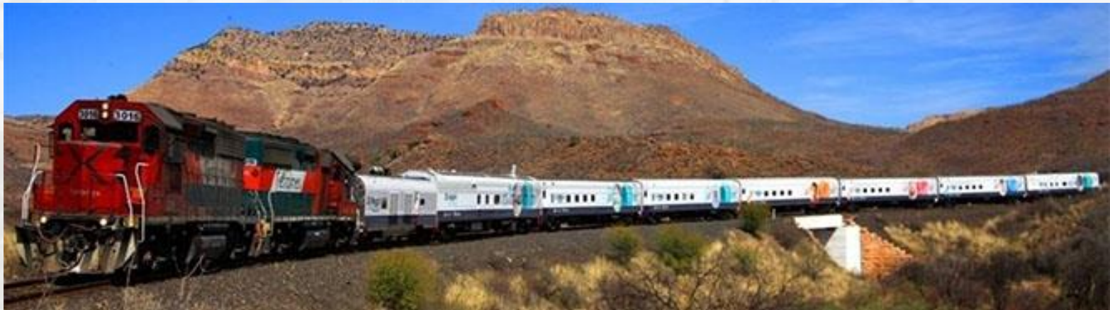
Example of power car and passenger cars repurposed by Railmark into cars for Mexico's Ferromex Health Train.

As an example, from 2012-2014 Railmark supplied and mechanically refurbished seven Budd passenger cars and a power car for Ferromex's (FXE) Health Train. The Health Train launched successfully in 2014 and has served hundreds of thousands of Mexican citizens living in areas without convenient medical care. Ferromex selected Railmark to perform this work based on the company's extensive railcar experience. All railcars were inspected and sourced by Railmark and reconditioned and certified for 110-mph (177 kph) service. To learn more about Mexico's Health Train, which Railmark played a key role, visit this link: www.youtube.com/watch?v=UO9WleEfK2E