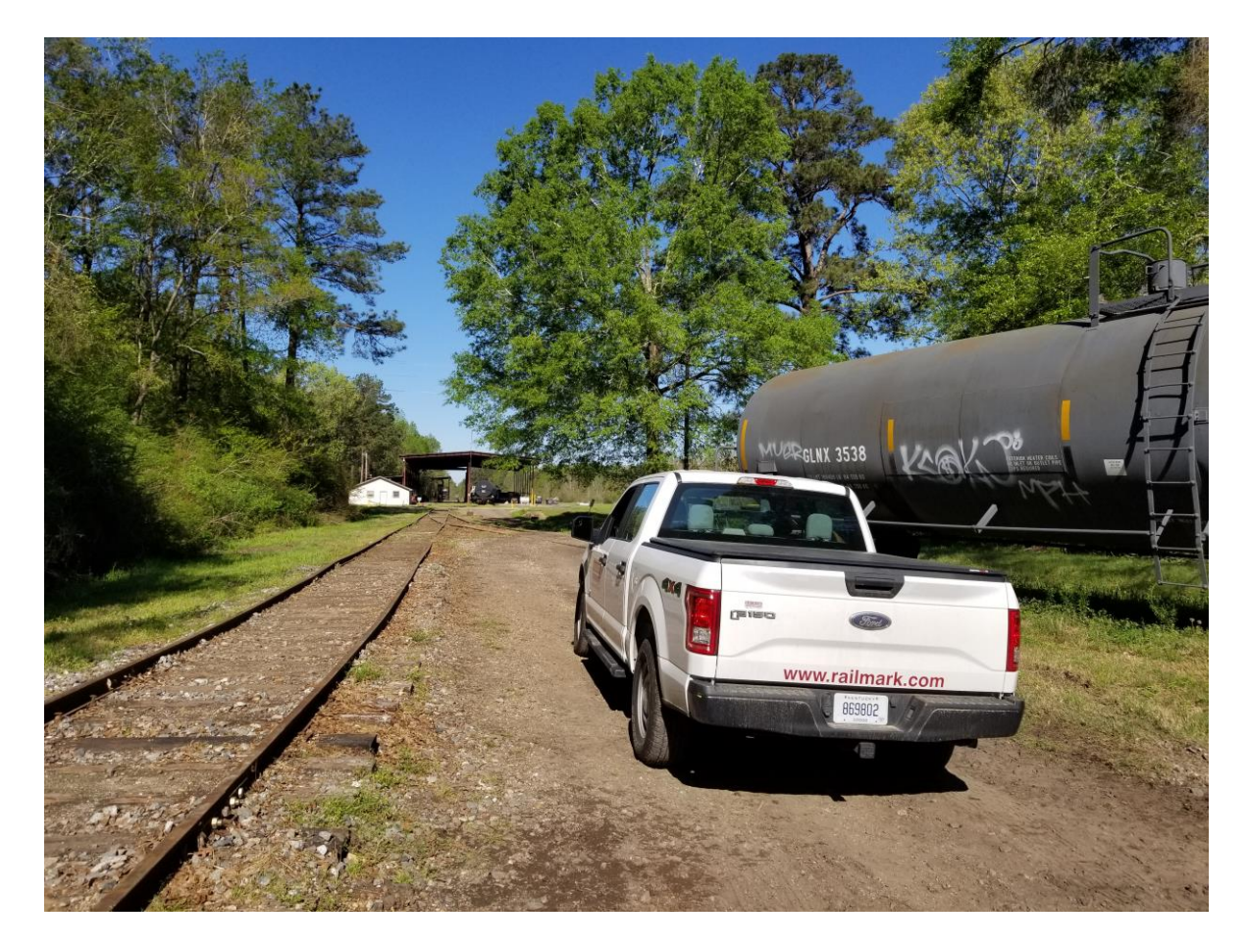
Multiple work track locations approximating 2.75 miles. Total facility comprises 15 acres.