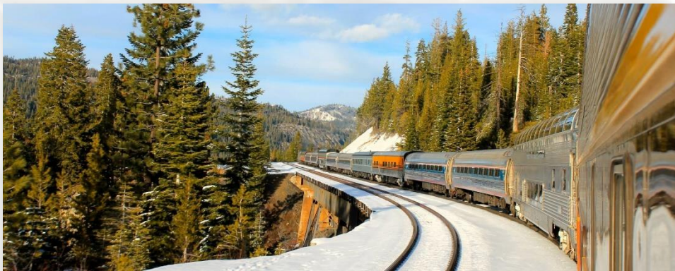
Key Tours International Snow Train

Key Tours International™ division offers international ecotourism experiences in Africa, international rail tours all over the world, and its unique branded Origins Tour Africa™ travel experiences.