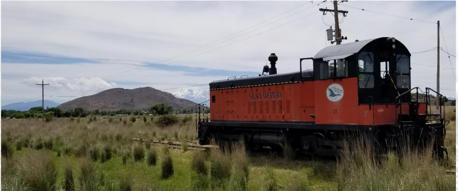
Locomotive YW 21 just outside of Montague CA, in the foreground of Mt. Shasta.

Whether its from one of Railmark's common carrier shortline railroads or using our transloading services at one of its six "Rail Service Centers", Railmark moves freight by rail.